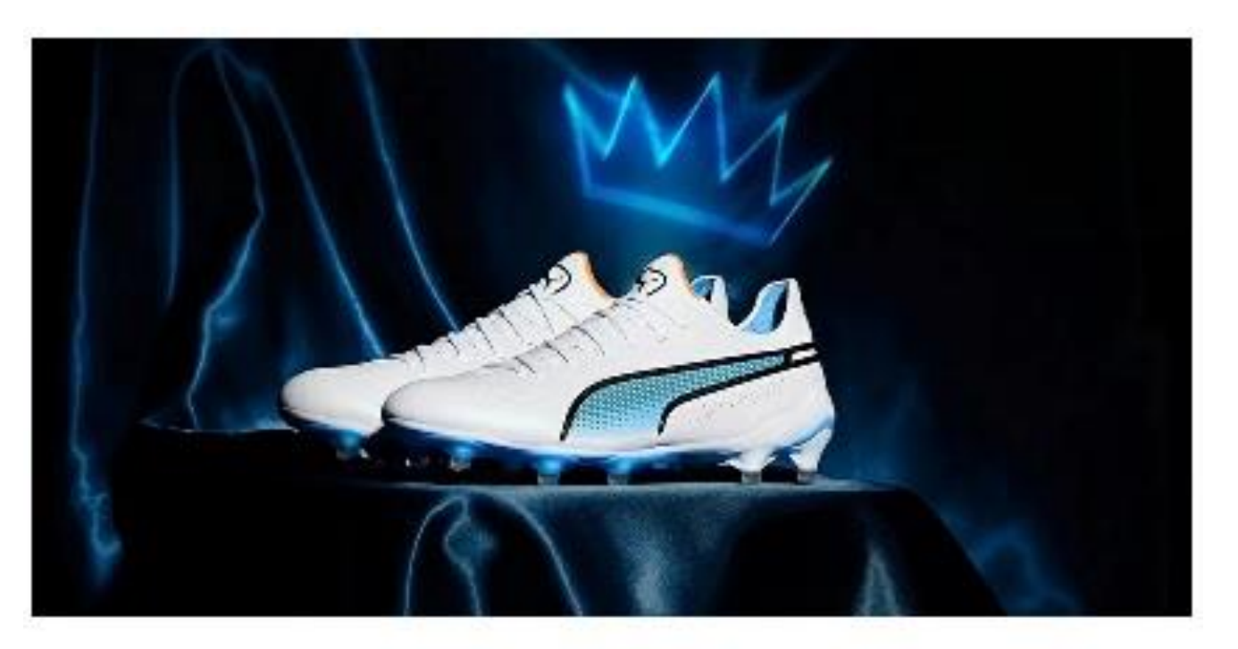
KING football boot with non-onimal based material.