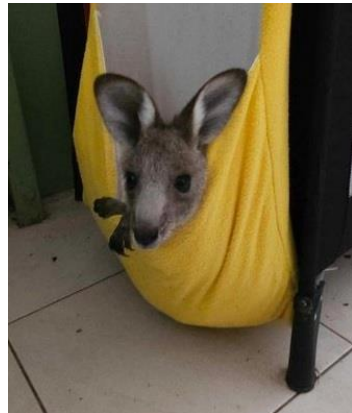
Warrumbungle Wildlife Rescue & Rehabilitation Tanya

https://www.facebook.com/warrumbunglewildlife/?locale=en_GB