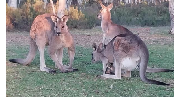
West Blue Mountains Greg & Diane Living with Kangaroos