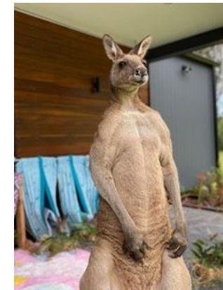
Wild2Free Rae Harvey South Coast https://wild2free.org.au/

https://www.facebook.com/warrumbunglewildlife/?locale=en_GB