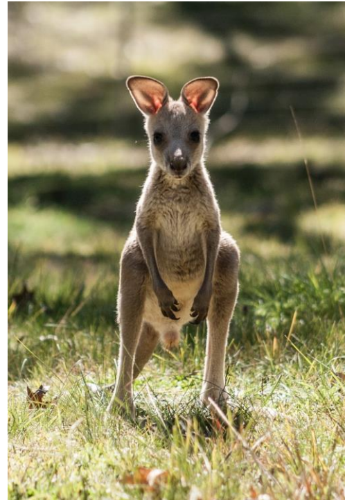
Tracy Kanimbla Valley

https://www.facebook.com/profile.php?id=100064517031471